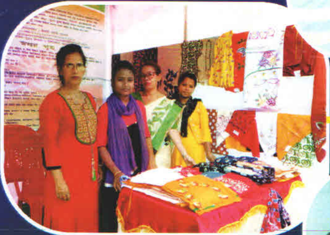
→ Exhibition of Swadhar greh products