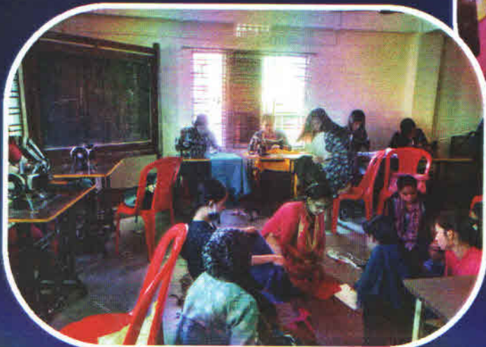
JSS tailoring training programme