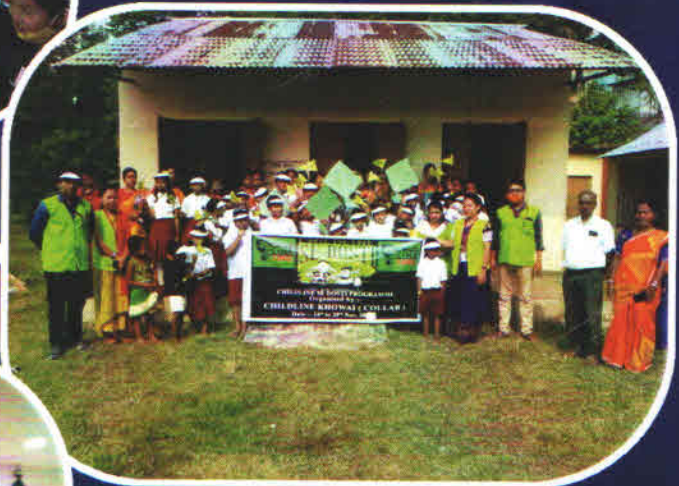
Childline Se Dosti Programme of Khowai