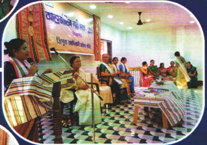
Women's Day Celebration ←