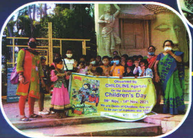
→ Visit of Creche Children to Heritage Park on Children's Day