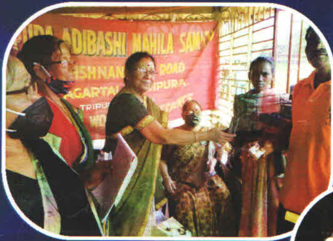
→ Distribution of contraceptive among brick field workers