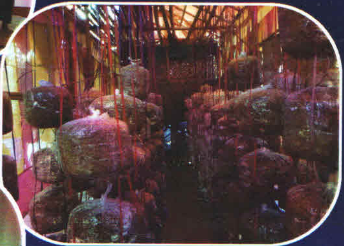
Mushroom Cultivation by SHG members at Lefunga