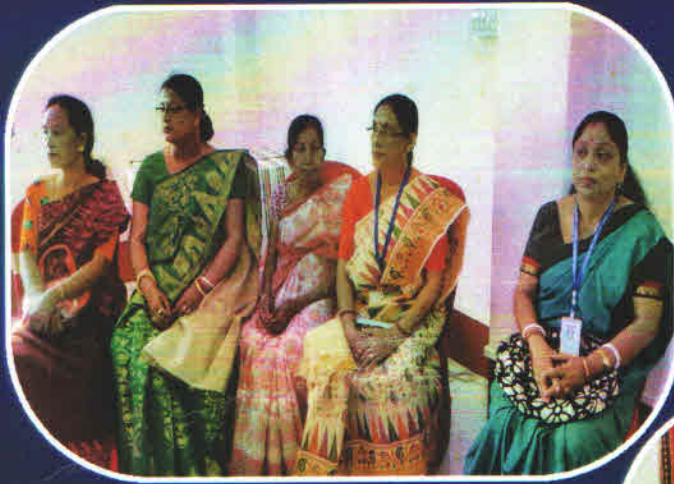
→ Five women felicitated on Women's Day