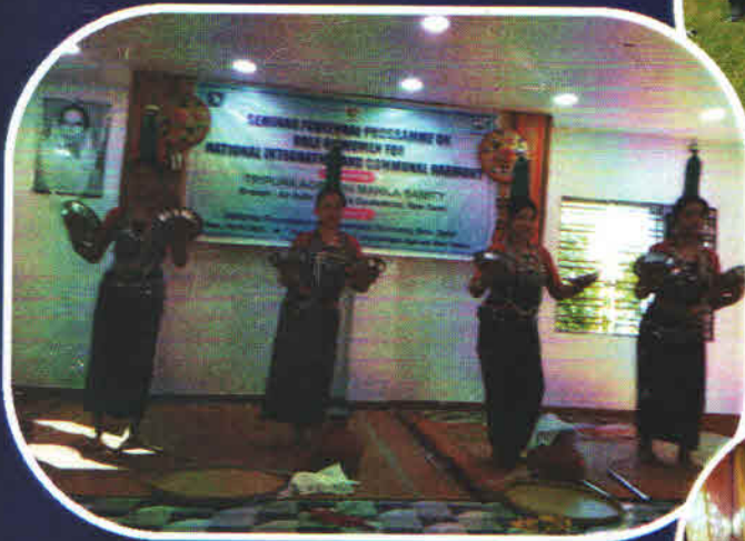
Cultural Programme of Communal harmony & National Integration programme