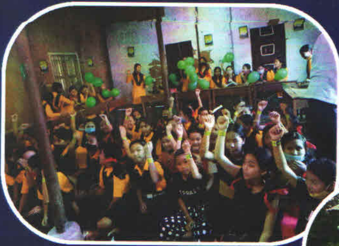
Childline Se Dosti Programme at Anurupa Academy