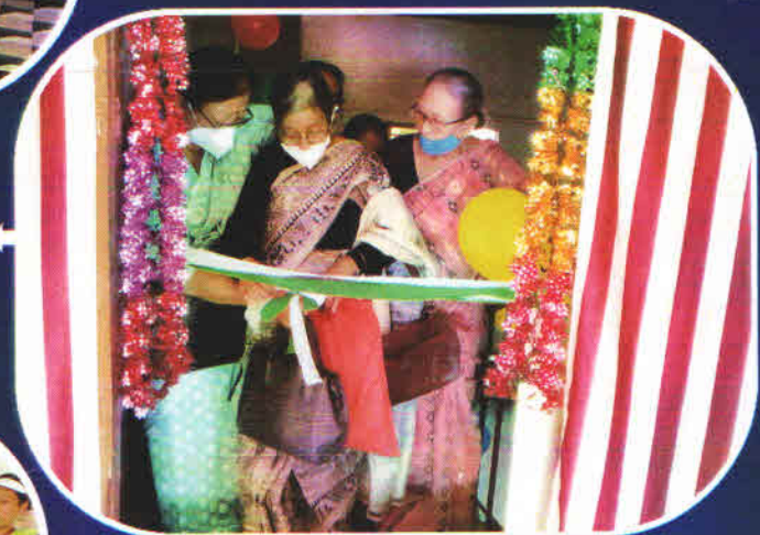
Hall Inauguration of TAMS ←