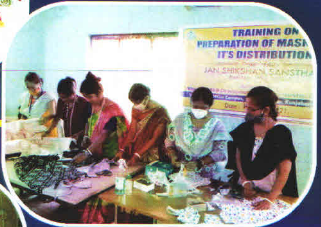
← Training on preparation of Mask