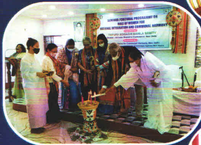
→ Inauguration of Seminar on Communal Harmony & National Integration