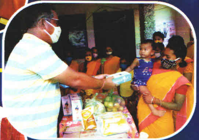
← Distribution of food Articles to Swadhar Greh inmates.